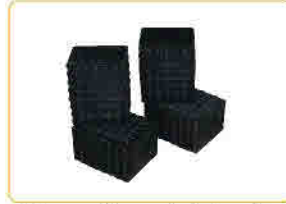
80 mm rubber pads ( 4 pcs.) 80 mm lastik kauçuk seti (4 adet.)