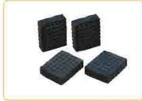
40 mm rubber pads ( 4 pcs.) 40 mm lastik kauçuk seti (4 adet.)